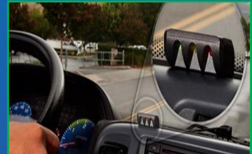
Fuel efficient driving