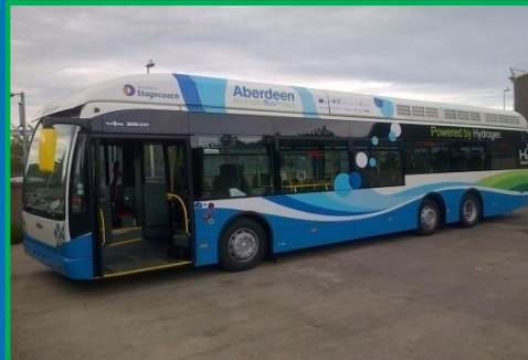
Hydrogen powered buses