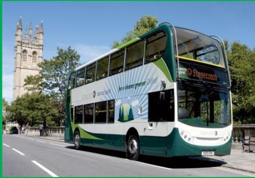
Hybrid electric buses